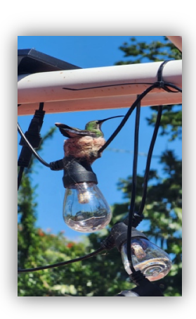
Our outside tents ripped. This allowed time for a hummingbird to make a nest and lay two eggs!