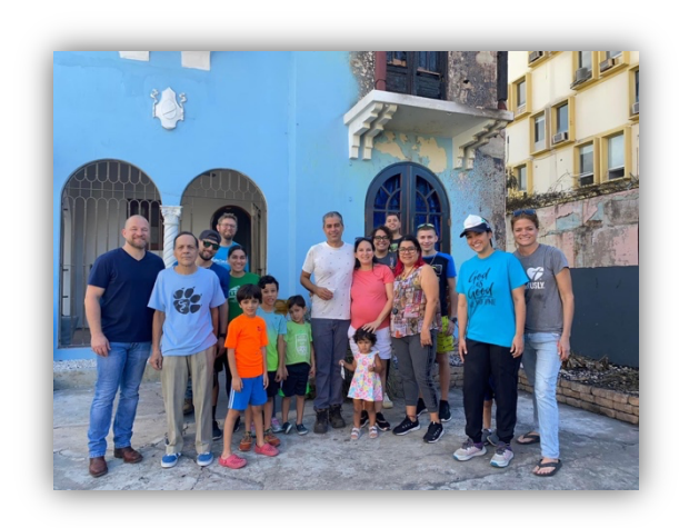
Members, friends, and neighbors helped clean after the fire.