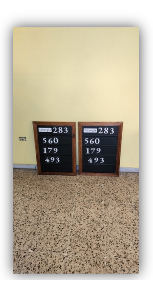
Completed and ready to hang hymn boards!